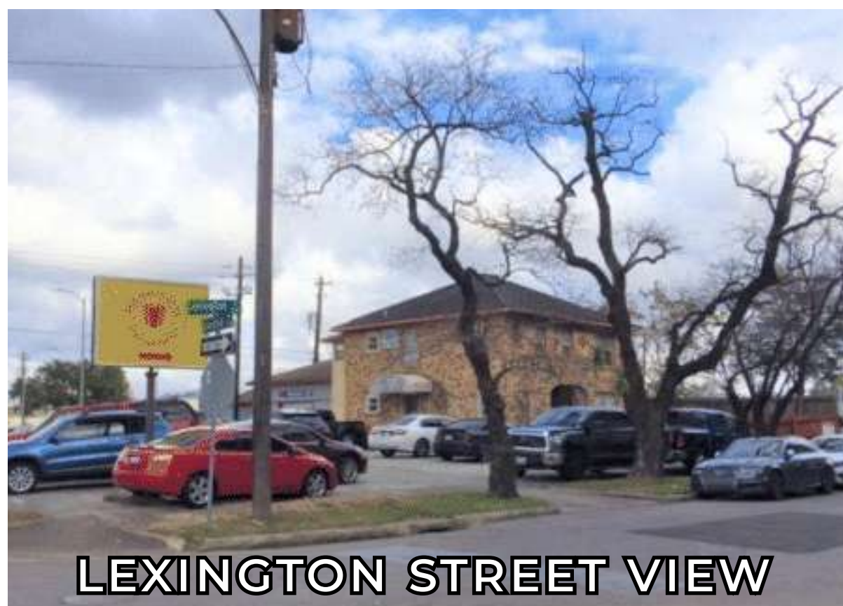
LEXINGTON STREET VIEW