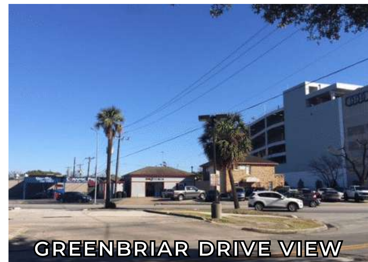
GREENBRIAR DRIVE VIEW